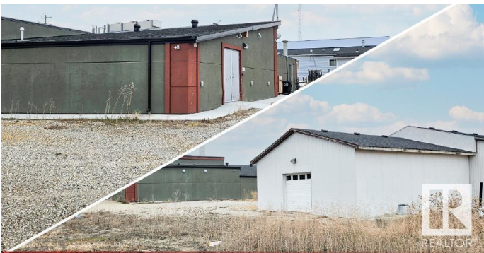
MAIN BUILDING PLAN