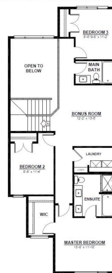
2ND FLOOR 1,084 SQ.FT (8 FT. CEILINGS)